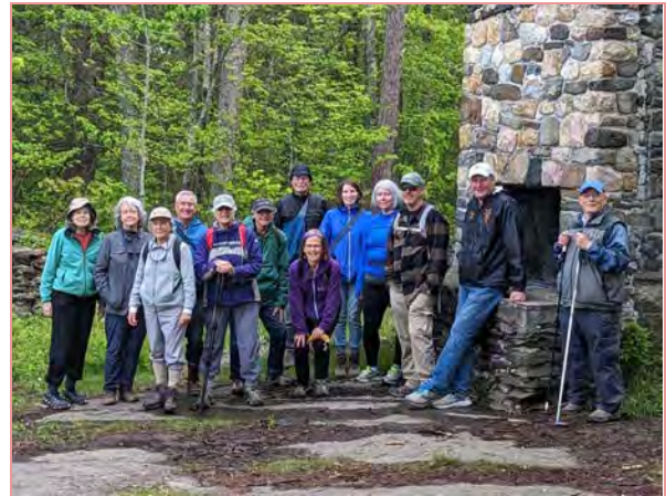
Hikers from Lady Slipper outing in May